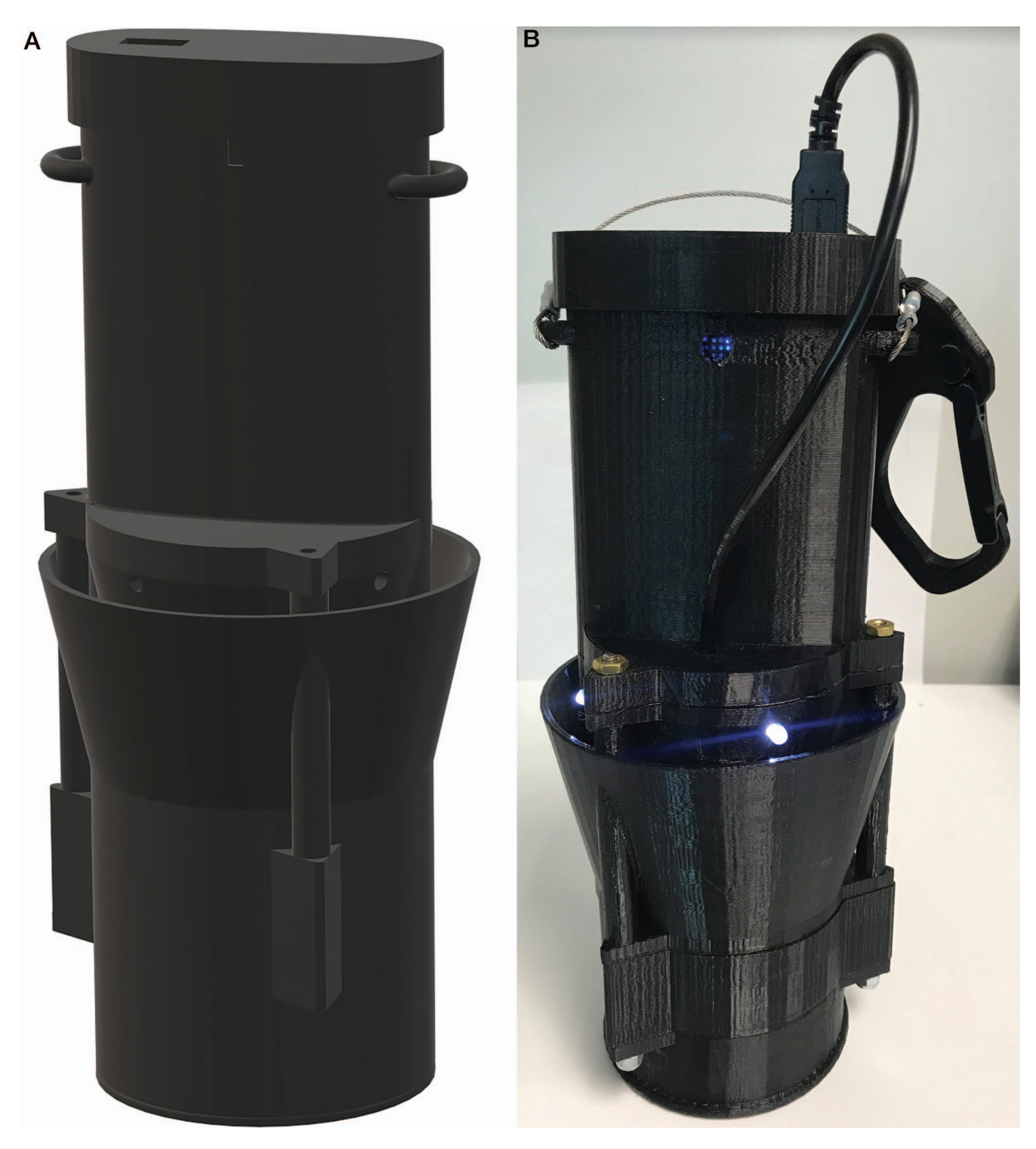
Figure 1.—(A) 3D model of the EVS trap produced using AutoCAD software. (B) Assembled 3D printed EVS trap.